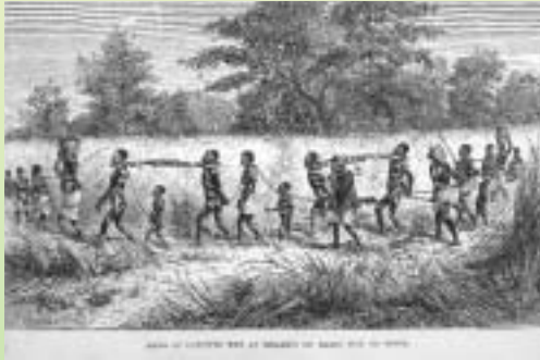
Image: Gang of Captives, D & C Livingstone, Narrative of an Expedition to the Zambezi, 1865.

Slaves were hunted in Africa and were marched to the coast in shackles, then shipped to the Americas in dreadful conditions