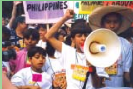
In 1998 trade unions, non-governmental organisations, the general public and working children from 92 countries came together to support the Global March Against Child Labour.

Open your mouth for the mute, for the rights of all who are destitute. Open your mouth, judge righteously, defend the rights of the poor and needy. (Proverbs 31: 8-9).