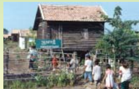
Photo: Return of unaccompanied Cambodian children, trafficked to Thailand to beg on the street, at the Krousar Thmey compound.

CHASTE, PO Box 983, Cambridge, CB3 8WY www.chaste.org.uk