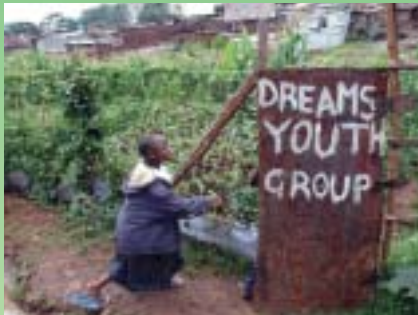
Photo: A girl entering a garden run by a Japanese NGO for street children in Kibera one of the biggest shanty towns in Africa.

A Home Office study found that in 1998 up to 1,420 women were trafficked into the UK for sexual exploitation and over £1 Billion a year is generated from sex trafficking in the UK. It is estimated that dozens of women are being used as sex slaves every year across Scotland.